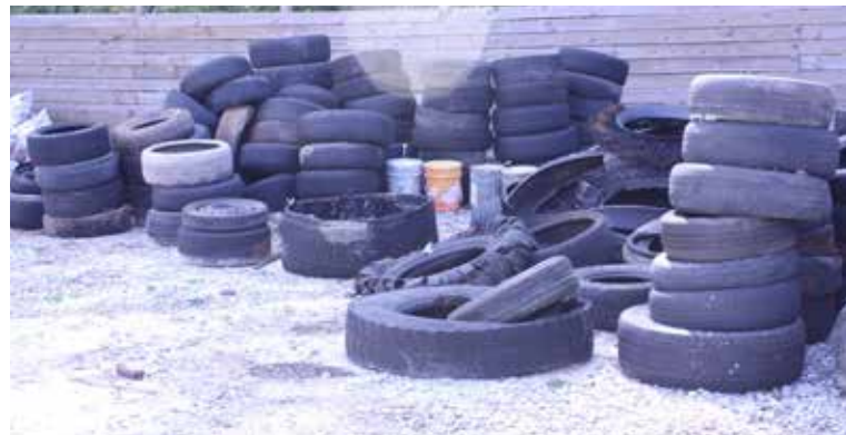
Over 150 tires were picked up and 195 bags filled before the end of the cleanup.