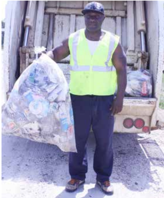
One of 195 PALS bags filled throughout the week after the routes are done.