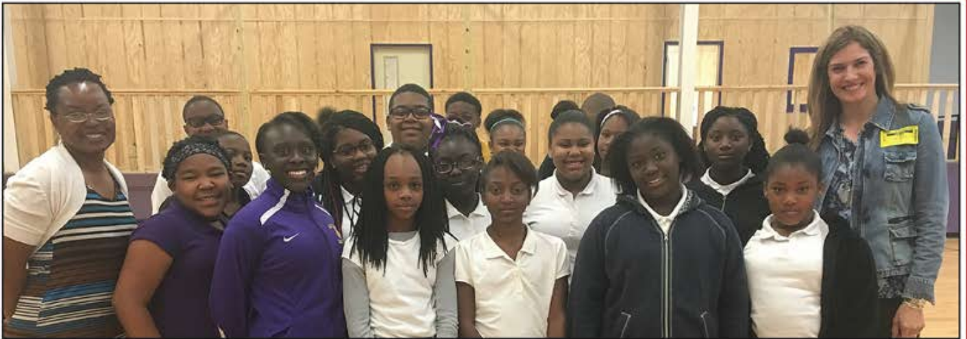
Robert C. Hatch School, Uniontown