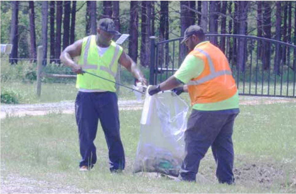
Takin' it to the streets with the Clean County Cowboys of Russell County Sanitation.