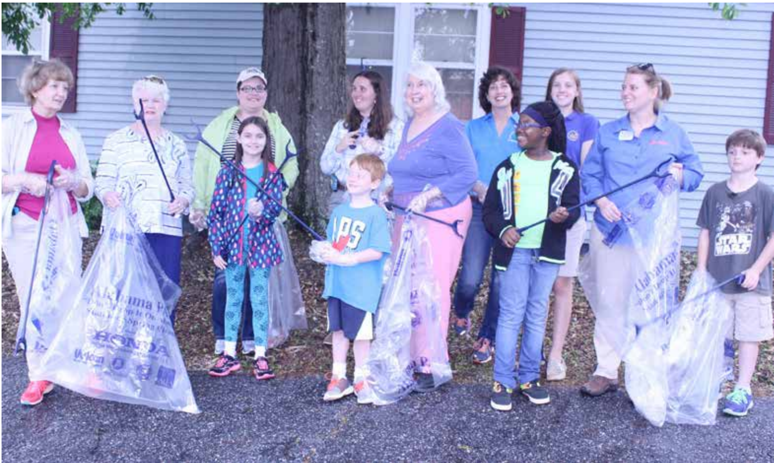
The Russell County Cooperative Extension put the 4H club to work during Spring Clean Up week of April 18-23. Armed with pick-up tools and PALS plastic bags and despite the inclement weather, the 4H club scattered in groups young and old to eliminate the litter on 14 th and Broad Streets. The best collection of trash was around the businesses on Broad. The second wave of volunteers dodged the raindrops on 5 th Avenue around the corner from the RCCE.