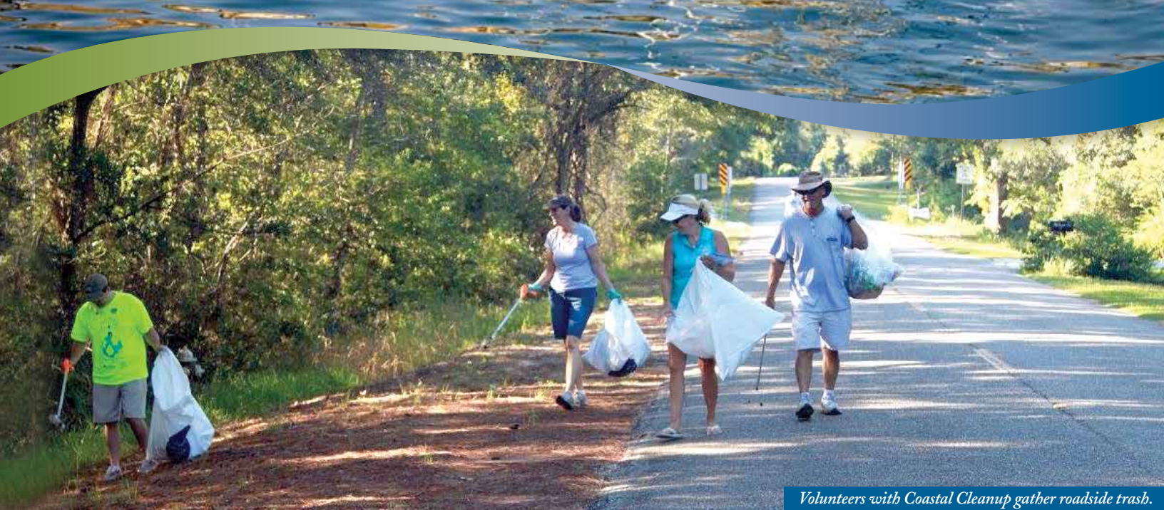
Volunteers with Coastal Cleanup gather roadside trash.