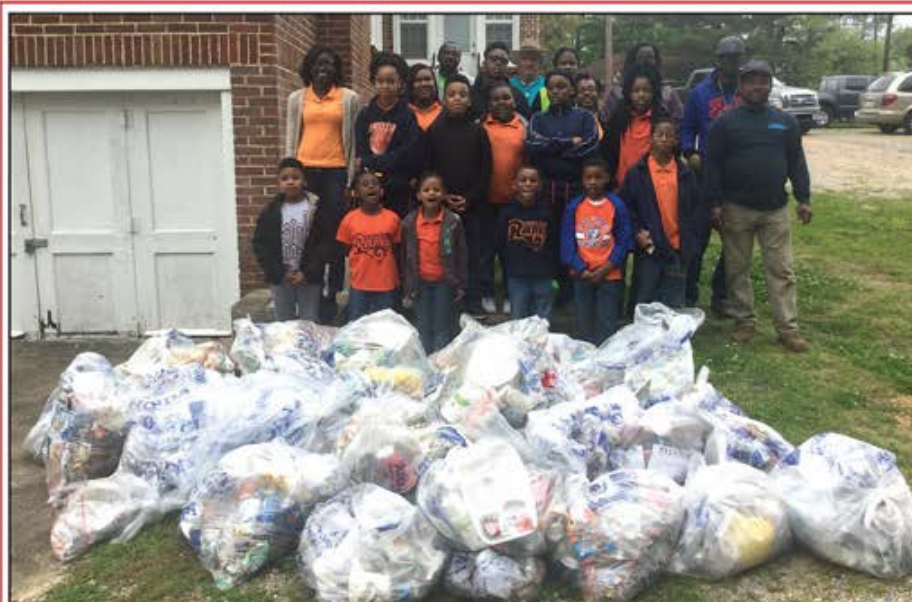
Francis Marion School, Marion

youngest all the way to the oldest students.