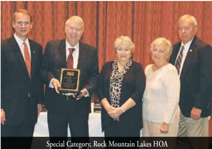
Special Category, Rock Mountain Lakes HOA