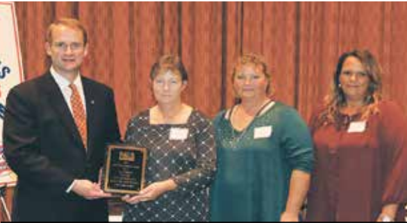
City Category, City of Cullman Sanitation Department