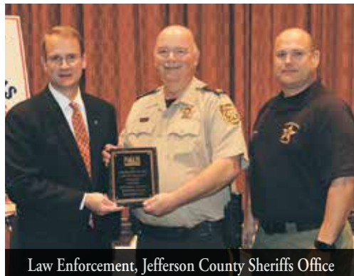
Law Enforcement, Jefferson County Sheriffs Office