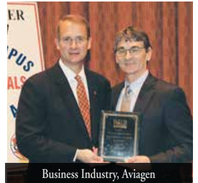
Business Industry, Aviagen