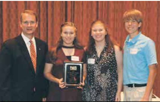
Adopt-A-Mile, Narrow Road