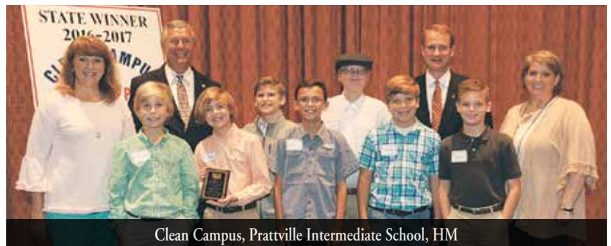
Clean Campus, Prattville Intermediate School, HM