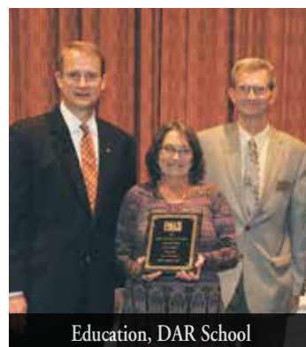
Education, DAR School