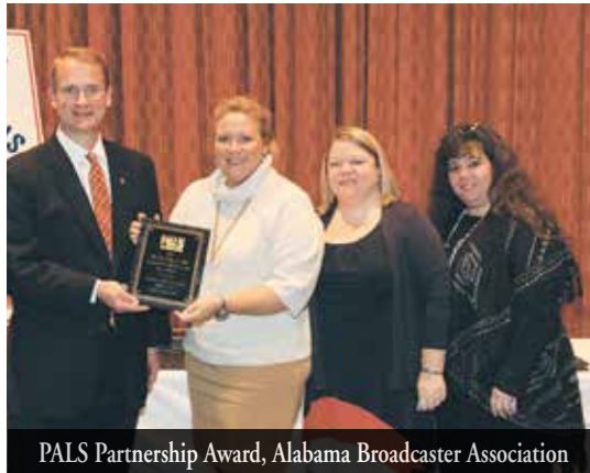
PALS Partnership Award, Alabama Broadcaster Association