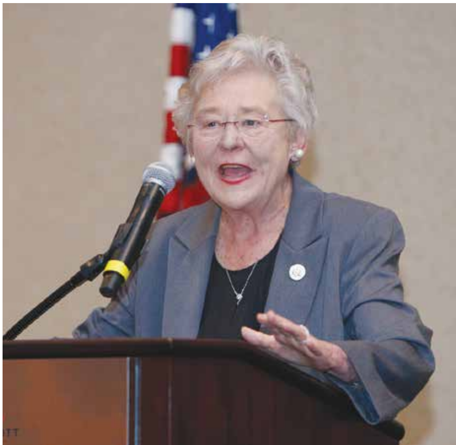
Governor Kay Ivey Praising the Statewide efforts of Alabama PALS at the 2017 Governor's Awards Program.