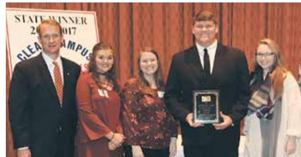
Education, Oak Grove High School