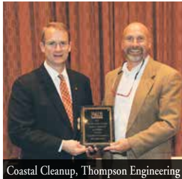
Coastal Cleanup, Thompson Engineering