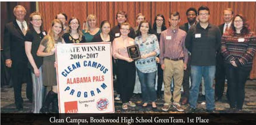
Clean Campus, Brookwood High School GreenTeam, 1st Place