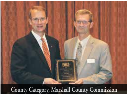
County Category, Marshall County Commission