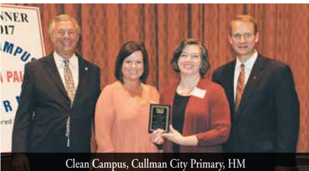
Clean Campus, Cullman City Primary, HM