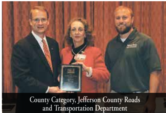
County Category, Jefferson County Roads and Transportation Department