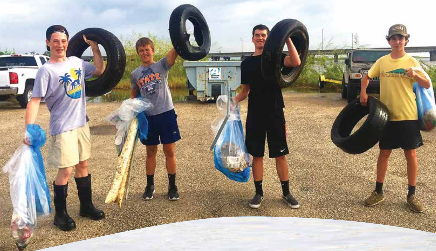
Clean up crew at the Causeway Zone.

Bebo's, LogoBrander's, ExxonMobil, Alabama Power Company, LuLu's, Ike's Beach Service, City of Gulf Shores, City of Orange Beach, Riviera Utilities, Utilities Board of Gulf Shores, Baldwin EMC, The Home Depot, Flora-Bama, MAWWS, Republic Services, Evonik, Bluegill Restaurant, Compass Media, Coast 360, ALFA, ALDOT, Honda Manufacturing of Alabama, Vulcan Materials Company, Alabama Farmers Cooperative, NOAA, The Ocean Conservancy, ADCNR State Lands, Coastal Section and Alabama PALS (People Against A Littered State).