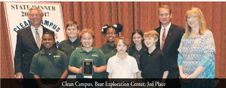
Clean Campus, Bear Exploration Center, 3rd Place