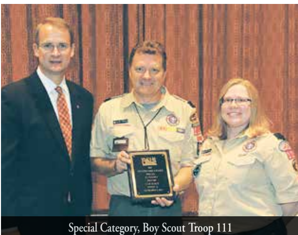
Special Category, Boy Scout Troop 111