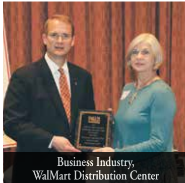
Business Industry, WalMart Distribution Center