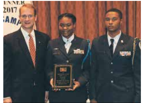
Adopt-A-Mile, Southside High School