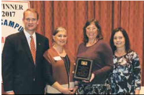
Dr. Hines Award, Jefferson County Storm Water Team