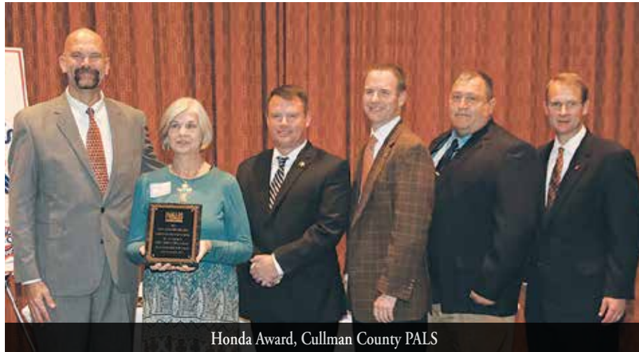
Honda Award, Cullman County PALS