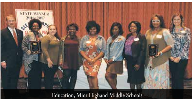
Education, Mior Highland Middle Schools