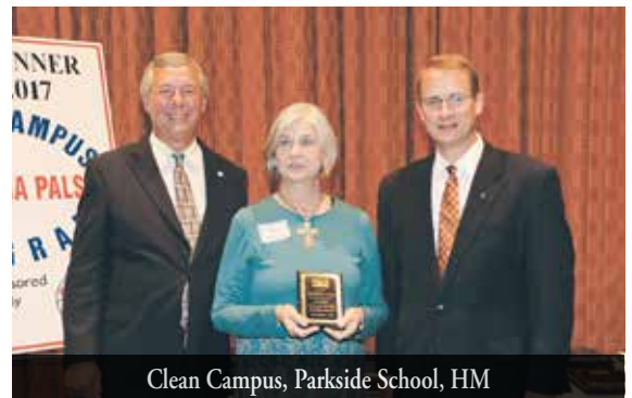
Clean Campus, Parkside School, HM