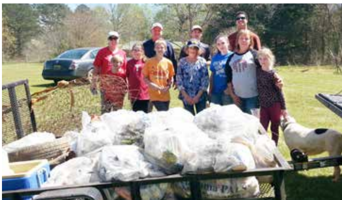
March 23, 2019 - Highland Home School Blue Crew 3 8 People spent 2 hours cleaning Sardis Road to Wilson Road and collected 23 bags totaling 410 pounds and also picked up 3 tires and a box spring.