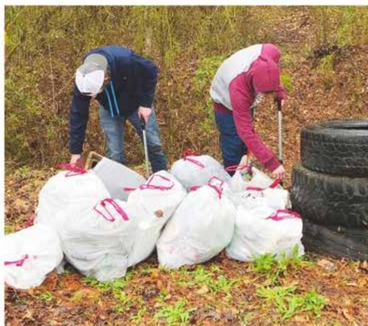
Two of the young men who worked in the clean-up are shown with just a bit of the litter the Marshall County Youth Advocate Program picked up on Whitesville Road.

Knight said Judge Jay Mastin routinely knocks some time off the service hours requirement when young people do good work like these have done.