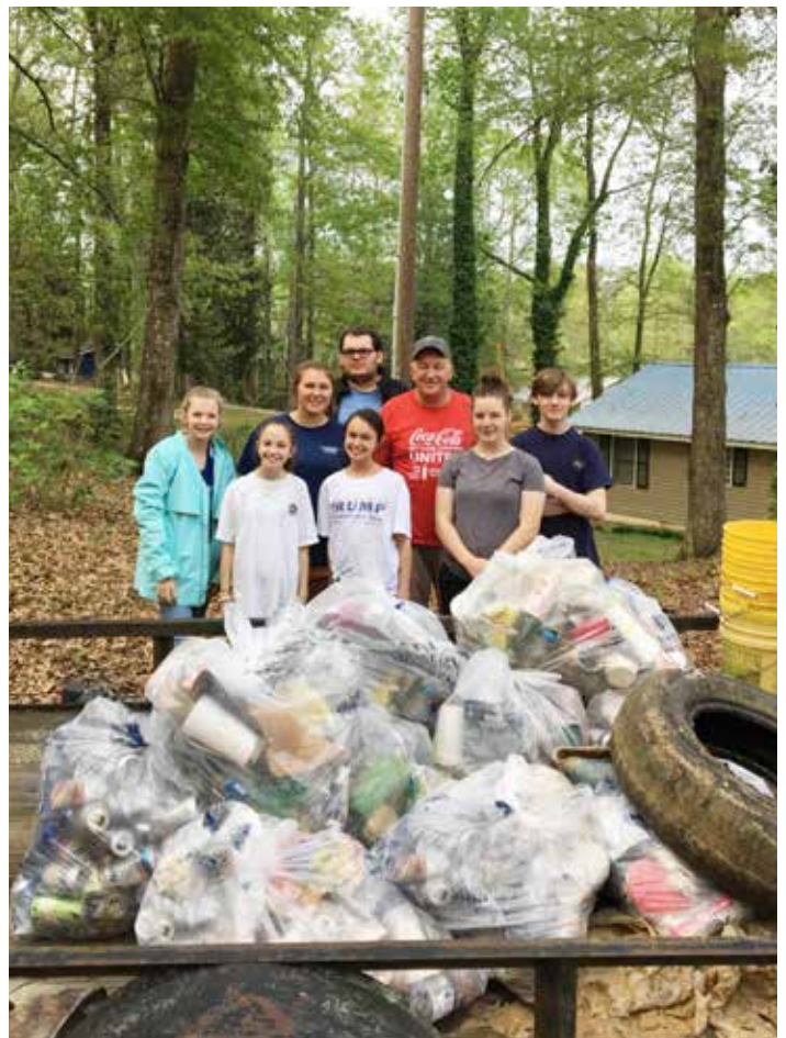
April 5, 2019 - Highland Home School Blue Crew 5 7 People spent 2 hours cleaning Magnolia Drive and collected 13 bags totaling 210 pounds and also picked up 3 tires and a box spring.