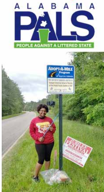
The Power of One! A special Thank you to The National Sorority Phi Delta Kappa, Inc. Upsilon Chapter for the water donation.