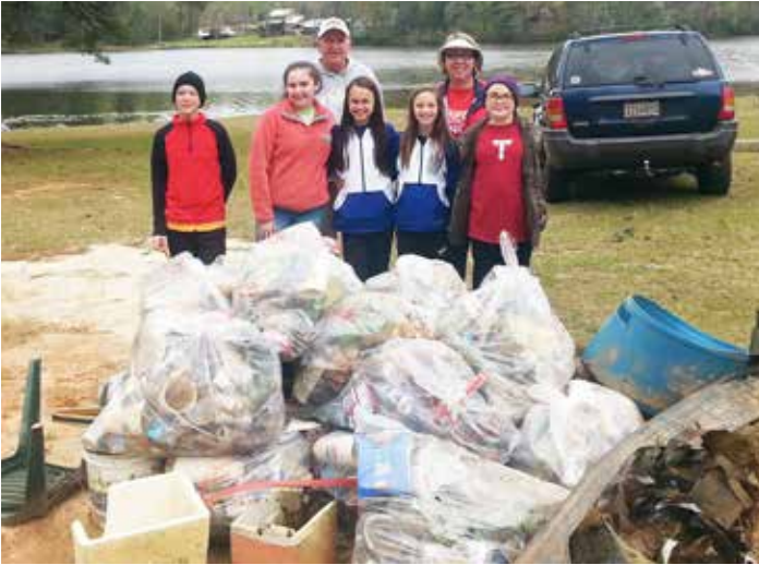
March 16, 2019 - Highland Home School Blue Crew 1 10 People spent 2 hours cleaning Highway 55 - Magnolia Shores Road and collected 19 bags totaling 520 pounds.