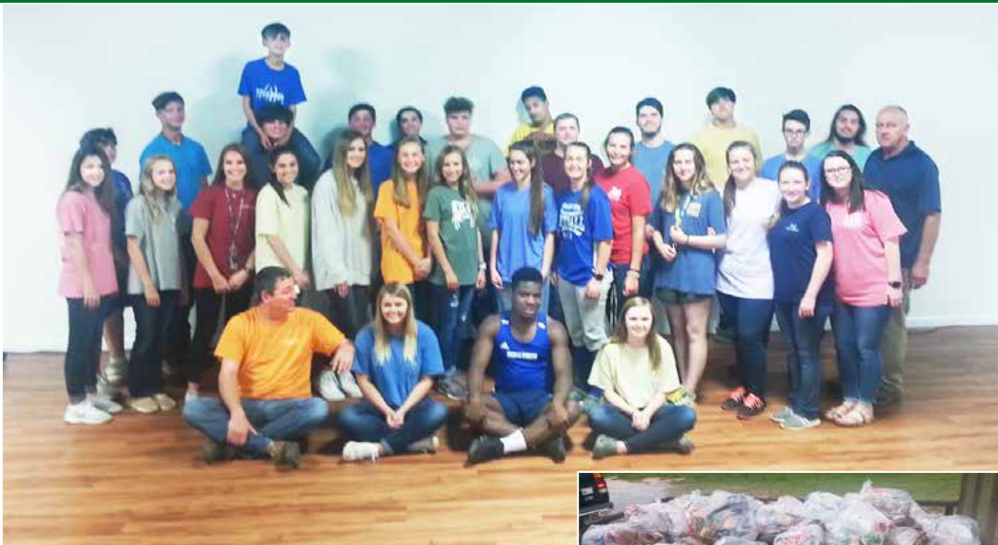
April 24, 2019 - Danielville Baptist Church 34 People spent 2 hours cleaning Daniel Branch Road and collected 33 bags totaling 420 pounds.