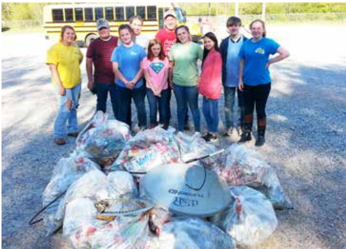
March 22, 2019 - Highland Home School Blue Crew 2 10 People spent 1.2 hours cleaning New Bethel Church Road and collected 17 bags totaling 350 pounds.