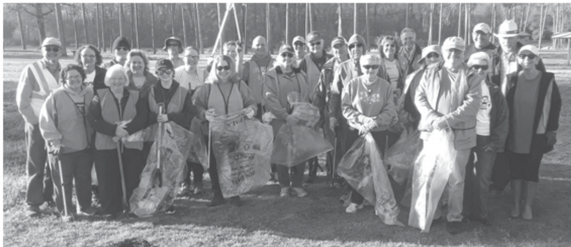
Several volunteers, including the Guntersville High Students for Earth, joined the Marshall County Democrats in their litter clean-up at County Park No. 1 Saturday.

Their next scheduled cleanup is June 22.