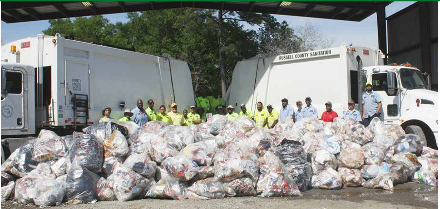
April 22-26, 2019 - Russell County Sanitation 25 People spent 4 hours cleaning Oliver Myers and Wilson Road and collected 500 bags totaling 15,000 pounds (7 tons went to landfill).