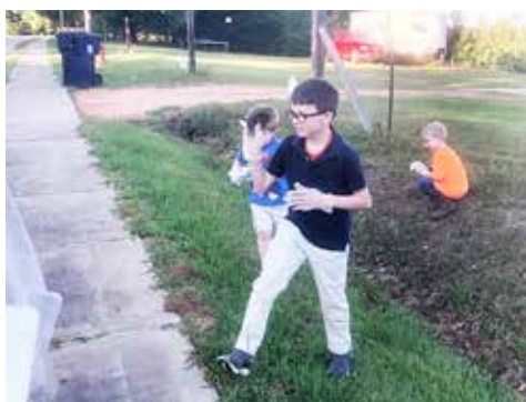
Town of Fulton – April 26, 2019 – We had three small young boys to help with clean up, two council members, the Town Clerk and some men from our fire department to help. The boys had the best of time picking up trash and calling them self's "litter getters". We got to ride with them in the fire truck to our different locations to pick up trash. A total of 15 people spent 8 hours gathering 26 bags of trash along highway #178.